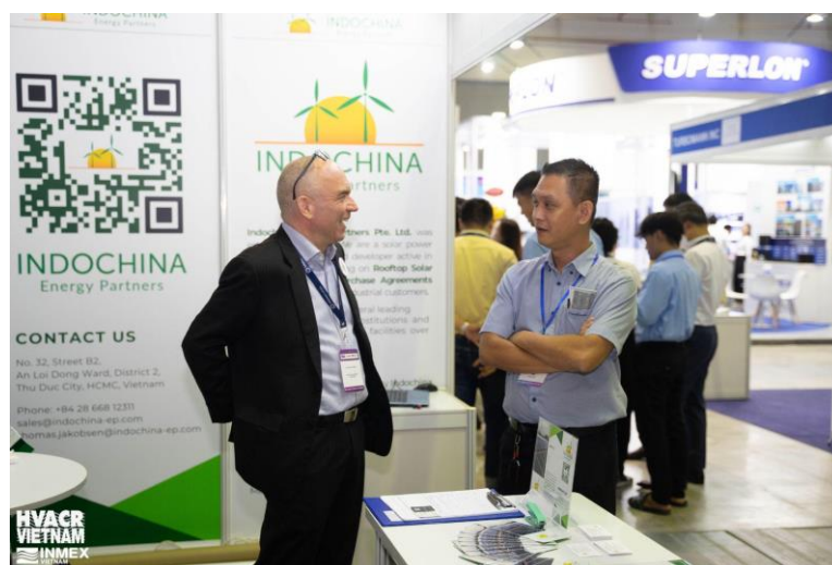
HVACR Vietnam is a trustable place for international companies to join and find potential clients