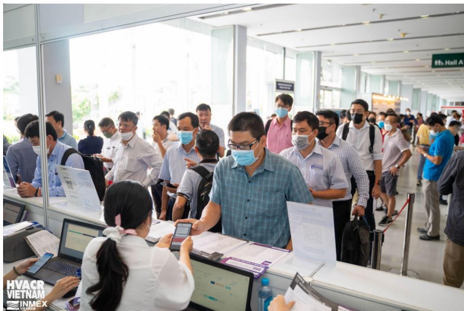
HVACR Vietnam attracted many industry experts on HVAC, Refrigeration & Smart Building Technologies industry

The 15th International Trade Exhibition on HVAC, Refrigeration & Smart Building Technologies in Vietnam called HVACR Vietnam will take place at International Center for Exhibition (ICE), Hanoi from 25 - 27 July, 2023. The event is a unique business platform specializing on Heating, Ventilation, Air-conditioning, Control, Refrigeration & Smart Building technologies which Informa Markets aims to create for professional stakeholders to showcase innovative solutions & products, maintain & establish relationships as well as exchange ideas & trends for the industry.